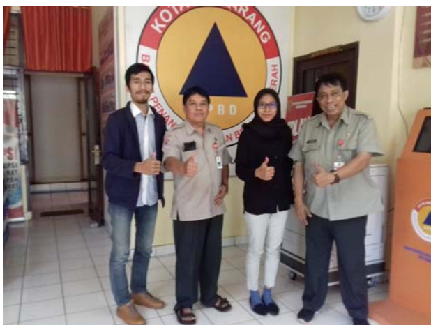
BPBD officials and Research Assistants

The first six month of BuGIS project saw researchers and research assistants engaging policymakers and communities as part of fieldwork. Policymakers included the Department of Public Work, Regional Disaster Management Agency (BPBD, July 2017), Regional Development Agency (BAPPEDA, August 2017) and Department of Environment Semarang (September 2017). The research team is intended to map the findings of this fieldwork with on-going analysis of policy framework of issues around BGI and flooding. Interviews are currently being undertaken with communities in case study areas (Tambakaji, Trimulyo, Banjir Kanal Barat). The findings will be discussed during policymakers workshop (being organised in November 2017).