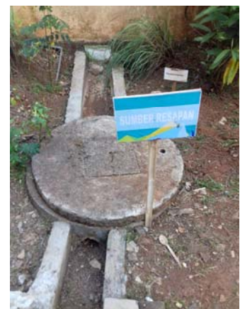
Infiltration Well in Padangsari