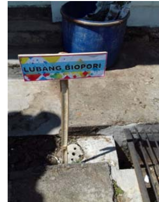
Biopore hole in Padangsari

BuGIS Research Assistants at UnDip have conducted a field survey of examples of BGI in Semarang. The survey was undertaken in Banyumanik region including Gedawang and Padangsari villages, and also in Department of Environment (DoE). In Gedawang, biopore holes were mainly created in the area around village office; very few in individual properties. In contrast, a higher participation was found in Padangsari where the village authority provided 40 biopore-making devices which were used by community, facilitated by local forums. However, maintenance was still an issues with many holes were abandoned and dysfunctional. In addition to biopore, examples of infiltration well were also found in Padangsari. DoE implemented rainwater harvesting units to state-owned schools. Legally, the DoE can only do this on state-owned properties; participation from individuals was low. Nevertheless, this implementation was viewed to serve as an educational purpose for the students.