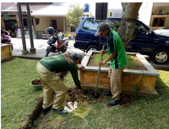
Biopore hole is being made