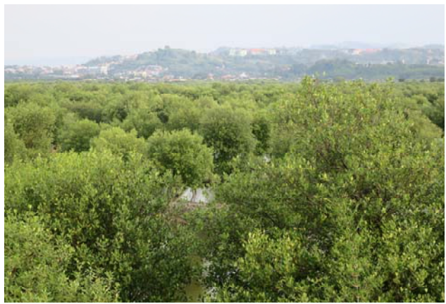
Mangrove forest with urban settlements in the background