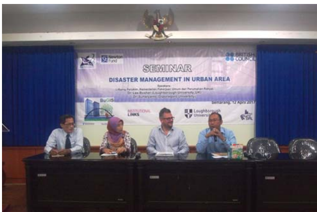
Speakers and Chair of the seminar