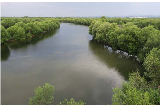
Mangrove forest, Tapak Tugurejo, Semarang