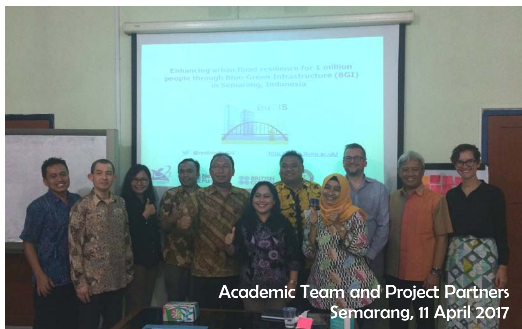
Academic Team and Project Partners Semarang, 11 April 2017