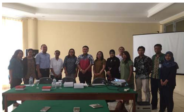
Participants of the event