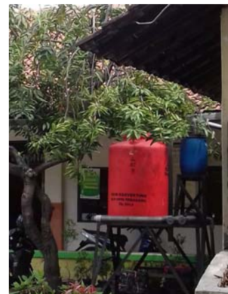
Rainwater harvesting in Schools

Following this survey, observation and targeted review of literature, few points can be drawn as follows: (i) biopore is low-cost example of BGI, and to be effective, would require community participation in their creation and maintenance; (ii) literature on modelling the effectiveness of biopore in other Indonesian cities suggests that biopore is not sufficient by itself to mitigate urban flood. Combination with other solutions is essential. Bear in mind that there is still a need for further evidence of their efficacy and assumptions in the evaluation; (iii) given the volume of water in the catchment areas in Semarang, many millions of Biopore in appropriate location and network are required to completely mitigate floods. The real challenge is that, given the current low level of take-up, is it feasible to implement biopore in large scale?