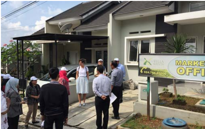
Briefing by the management of property developer

Following the seminar on 12 th April 2017, BuGIS team spent the afternoon visiting local property development and mangrove forest in coastal areas of Semarang. During the visit, the manager of property development company gave an overview of housing development in the local areas and incorporation of green infrastructure. Mangrove forest in Tapak Tugurejo, Semarang provided an example of green infrastructure for protection against coastal erosion and flooding, amongst its various eco-system functions.