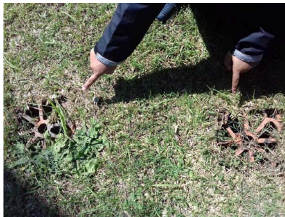
Biopore holes in Gedawang Village Office