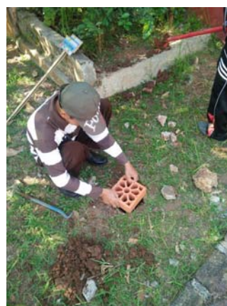
Installation of lid to a biopore hole