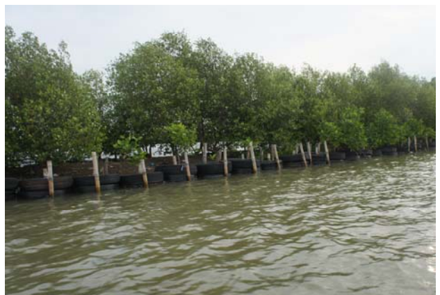
Used tires to reduce coastal erosion