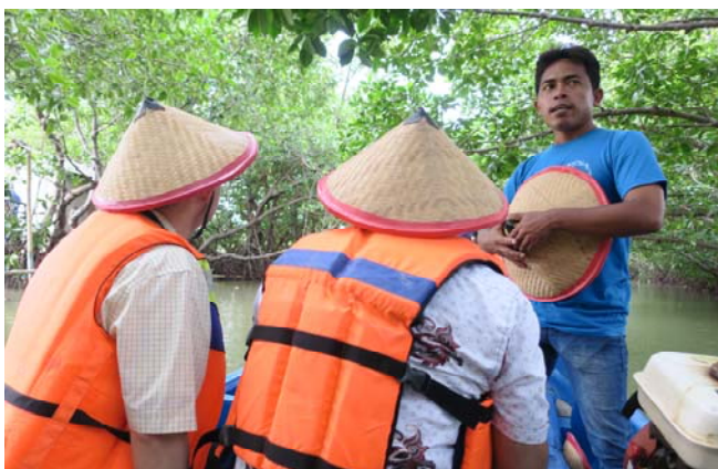
BuGIS team listening to a tour guide on a boat