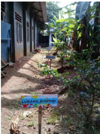
Biopore holes in Padangsari