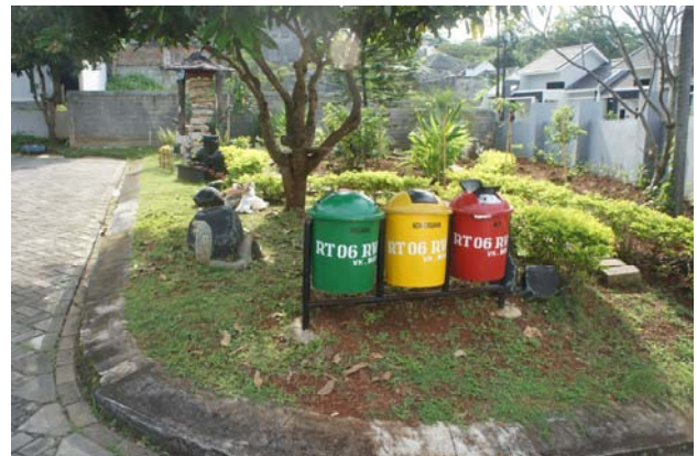
An example of green infrastructure and raising awareness of waste management in local property development